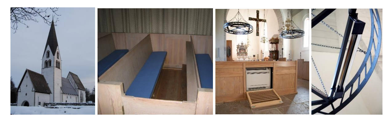
Figure 2: a) Garda church, b) the church benches with integrated heating foils in the back and radiators below the seat, c) the heat pump and overhead radiators) detail of overhead radiator

Garda church is located on the south eastern part of Gotland. The church is constructed in limestone and was erected in the 12th century. The church is intermittently heated with a few services per month.