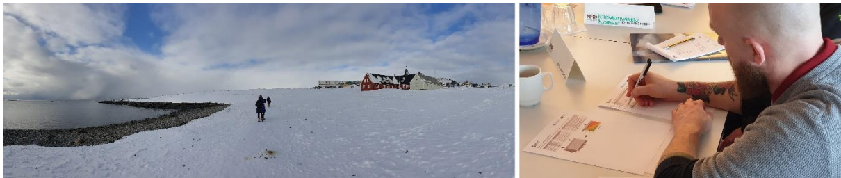
Figure 5. The training seminars for professionals were a condensed and simplified version of the workshop format. The seminar in Nuuk, Greenland, depicted above, used the site of the Moravian Brethren Mission House as case study (left) for explore various assessment techniques (right).

The seminars were essentially condensed and simplified versions of the workshops, using a well-known, local historic place, selected in collaboration with a seminar's host organisation. The seminar in Nuuk, for example, took place in March 2020 in collaboration with Nunatta Katersugaasivia Allagaateqarfialu / Greenland National Museum and Archives, and the Moravian Brethren Mission House, a historic place at the tip of the old city's peninsula, was chosen to explore adaptation strategies for this coastal site with its colonial buildings and remains of an associated Inuit settlement (Figure 5).