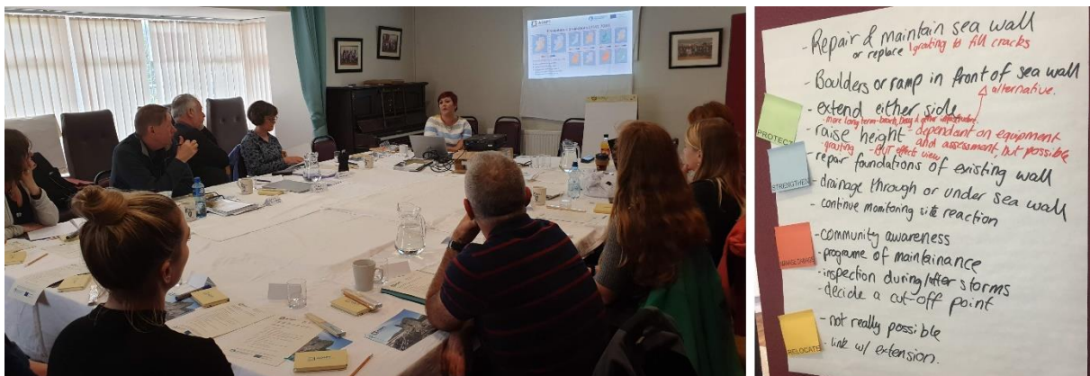
Figure 3. Stakeholder workshop at Ballinskelligs, County Kerry, Ireland, in 2019: The left photo shows a facilitated group discussion; the right photo summarises the results of a brainstorming exercise to identify adaptation measures, using a categorisation system (represented here with coloured markers).

Responses at the Ballinskelligs workshop (Figure 3) included extending the sea wall, increasing its height, constructing wave breakers either at the wall or at other locations in Ballinskelligs Bay, building a shelter structure around the abbey and/or castle, investigating tidal movement in the bay, documenting the place's deterioration and loss, and recording it digitally to create virtual reconstructions.