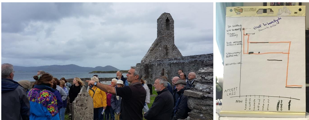
Figure 4. The Ballinskelligs workshops involved site visits of the abbey and castle as case study sites, with guided tours for the stakeholders and local community. The workshop finished with producing a pathways roadmap, illustrating the temporal dependencies of the adaptation measures identified.

At Ballinskelligs, the participants concluded that no immediate construction activities are required and that investigating tidal movement in the bay should instead be prioritised to help decide in the future if wave breakers or alterations of the sea wall would be the better adaptation measure (Figure 4).