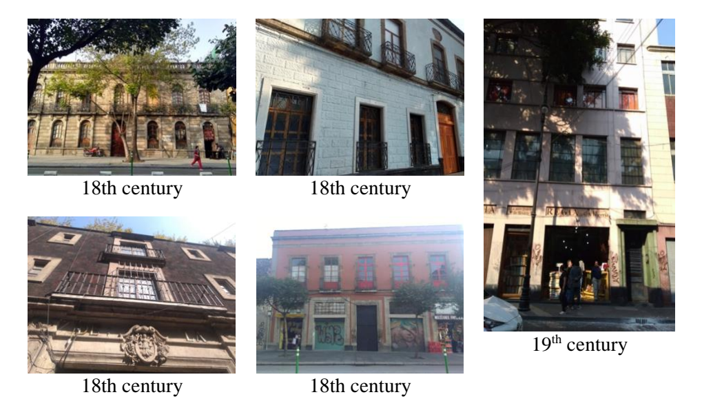
Image 1. Architectural styles of buildings included in the final sample

inventory. Subsequently, between December 2018 and January 2019, residents were interviewed in five apartments of buildings. On the same day, environmental monitors for temperature and relative humidity were installed. The housing buildings in this study are part of the local regeneration program of the City Council of Mexico City. The heritage area is occupied in most if it by social housing inhabited by people with limited resources while other buildings that have been conserved and renovated are privilege for commercial uses. The historical buildings preserve the original typology of the architectural unit and are part of the World Heritage Site catalogue (134 residential buildings). The representative sample included one historical monument, one unlisted but protected building apartment and three listed apartment buildings. A historical monument is linked to the history of the nation, and a building is listed or protected because of its historical or artistic value or its age. Their architectural styles range from the 18th to 19th century (predominantly baroque or colonial style), which define each building's construction materials (tepetate, cantera and brick) (Image 1).